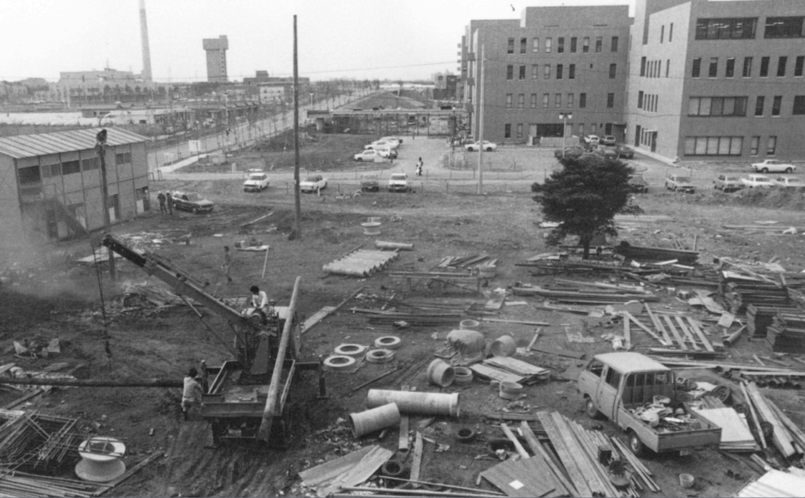
Faculty of Art and Design under construction University of Tsukuba, Early 1970s