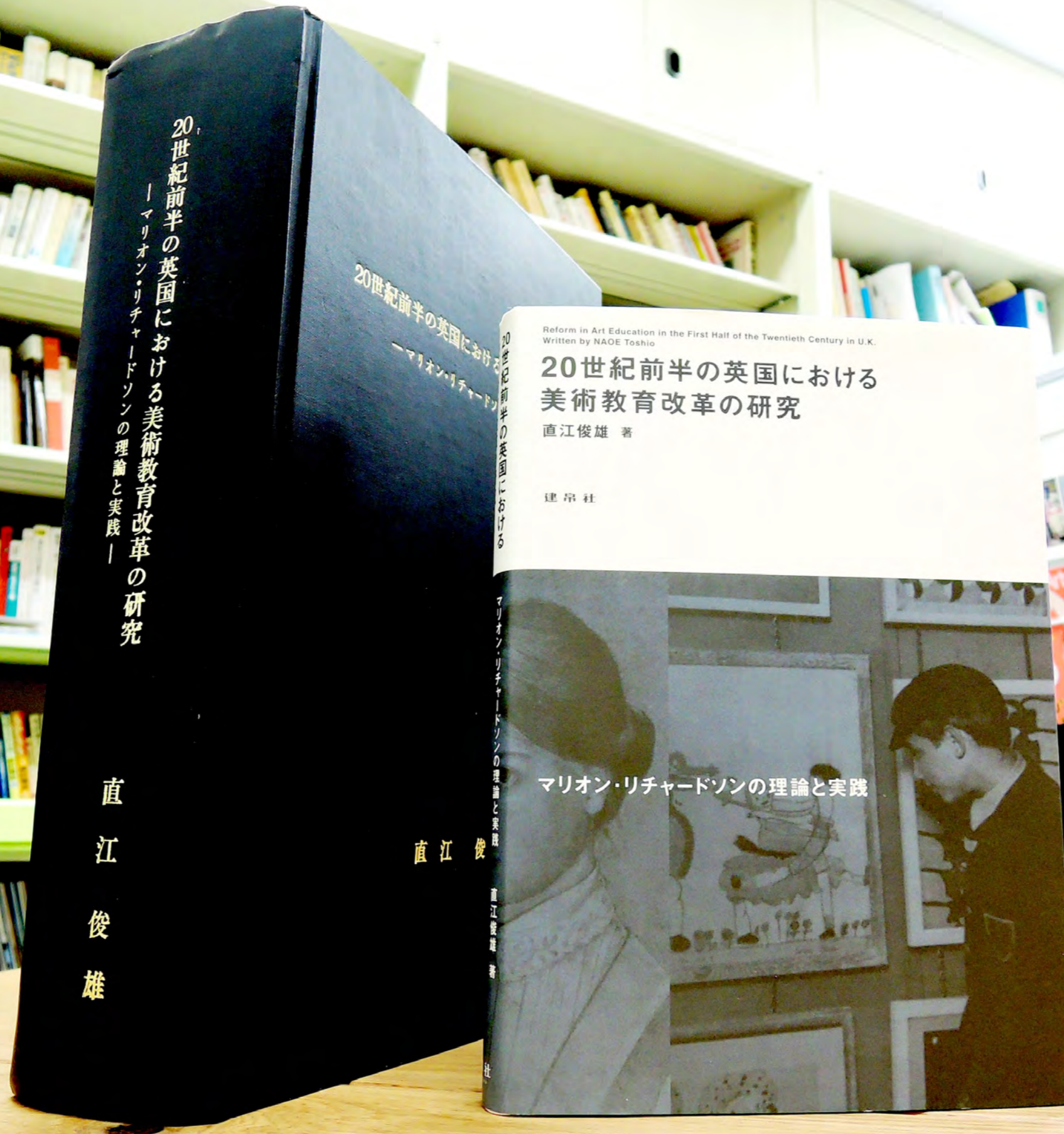
Toshio Naoe, Reform in Art Education in the First Half of the Twentieth Century in the United Kingdom: Theory and Practice of Marion Richardson , 2000, 2002.