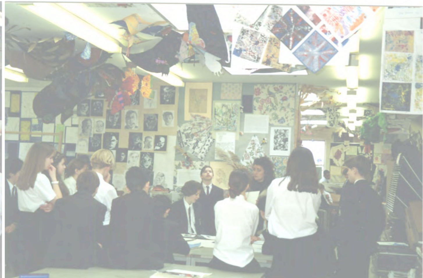
Art classes in secondary schools: Japan and UK, 1990s